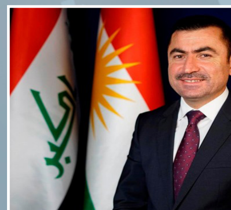
DARA RASHID MAHMOUD MINISTER OF PLANNING