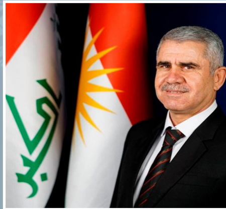
KAMAL MUSLIM SAEED MINISTER OF TRADE AND INDUSTRY