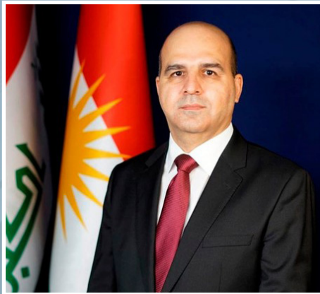
SASSAN OSMAN OUNI HABIB MINISTER OF MUNICIPALITIES AND TOURISM