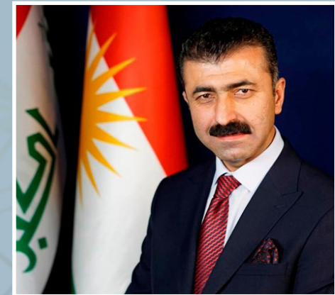
DANA ABDUL KARIM HAMA SELEH MINISTER OF CONSTRUCTION HOUSING