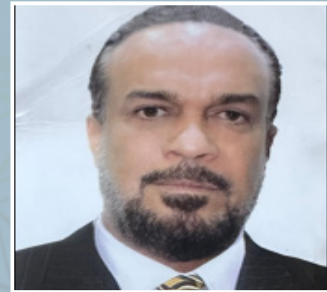
ALJANNOOB PANEL GENERAL MANGER OF ALJANOOP PANEL COMPANY