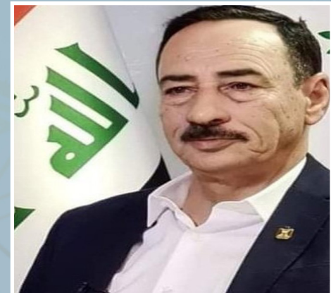
NAJM AL-JUBOURI GOVERNOR OF MOSUL