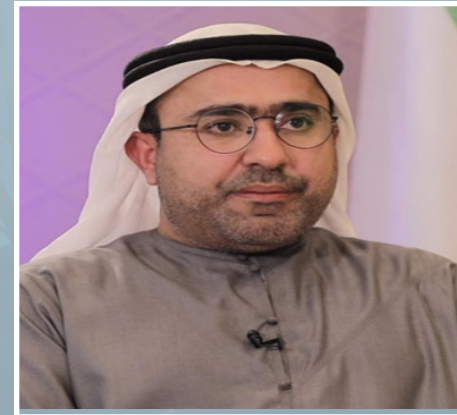
AHMED AL-DHAHERI THE CONSUL GENERAL OF THE UNITED ARAB EMIRATES IN KURDISTAN REGION