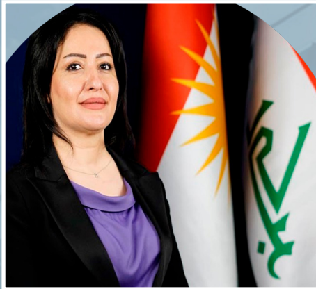
VALA FAREED IBRAHIM MINISTER OF STATE FOR PARLIAMENT AFFAIRS