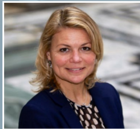
ROSY CAVE THE BRITISH CONSUL GENERAL IN KURDISTAN REGION