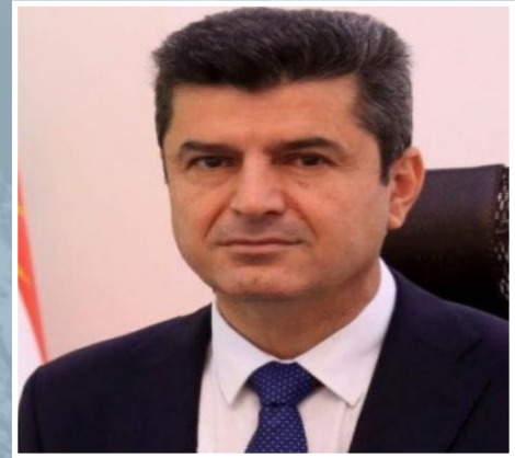
ALI TATAR TAWFIQ GOVERNOR OF DUHOK