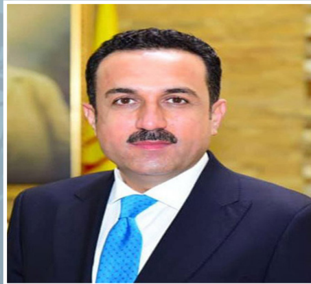
OMEED KHOSHNAW GOVERNOR OF ERBIL