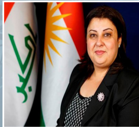
BIGARD DLSHAD SHUKRALLA MINISTER OF AGRICULTURE AND WATER RESOURCES