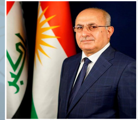
AWAT JANAB NURI MINISTER OF FINNANCE AND ECONOMY