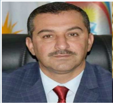
HAVAL ABU BAKR GOVERNOR OF SULAYMANIYAH