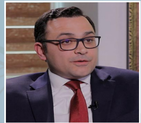
MOHAMED MOULOUD YAQOUT TURKISH CONSUL IN KARDISTAN REGION