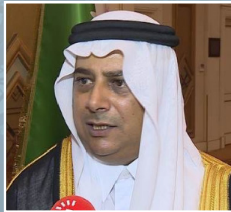
MOHAMED BIN SULEIMAN THE SAUDI CONSUL GENERAL IN KURDISTAN