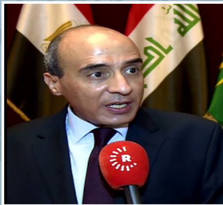
MOHAMED WAJIH HAJJAZI THE CONSUL GENERAL OF EGYPT IN KURDISTAN REGION