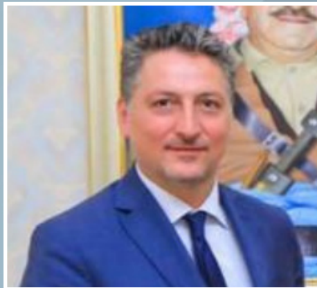
MICHELE CAMEROTA THE CONSUL GENERAL OF ITALY