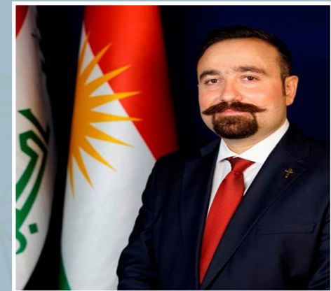
ANO JAWHAR ABDULMASEH MINISTER OF TRANSPORTATION AND COMMUNICATIONS