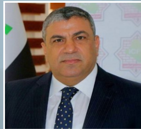
ALI AL - SENAFI PRESIDENT OF THE ARAB CONTRACTORS UNION