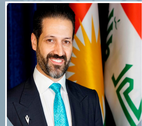
SPEAKER OF THE THIRD SESSION QUBAD TALABANI DAPUTY PRIME MINISTER