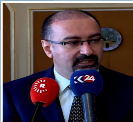
FUAD KHAZIR THE CONSUL GENERAL OF THE HASHEMITE KINGDOM