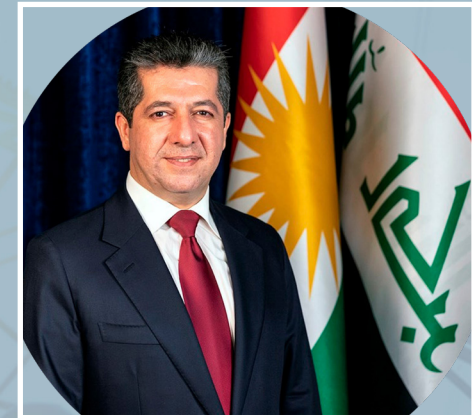
MASROUR BARZANI HIS EXCELLENCY THE PRIME MINISTER